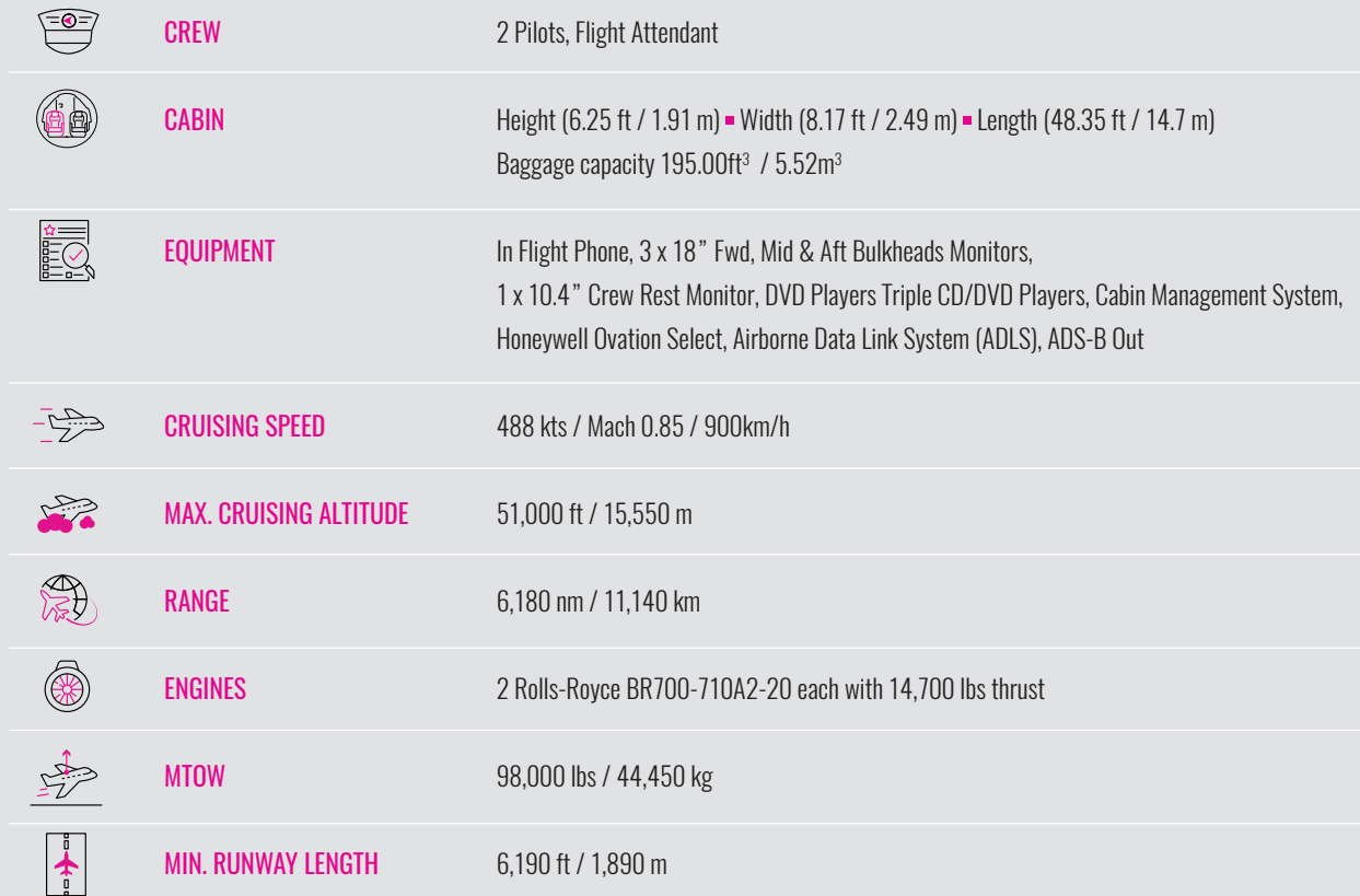
SEATING CONFIG. Up to 10+1 passengers (in crew rest compartment)